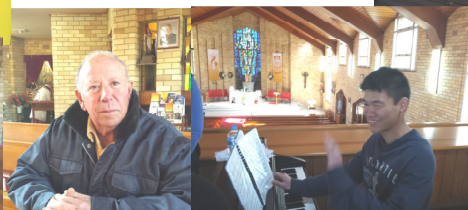
...and last week