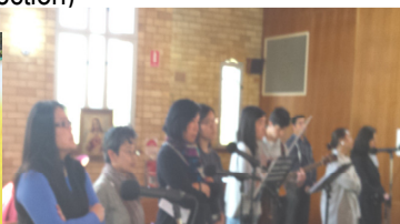
From last weekend...