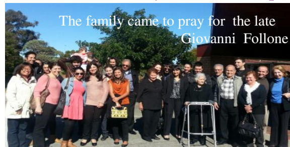
The family came to pray for the late Giovanni Follone