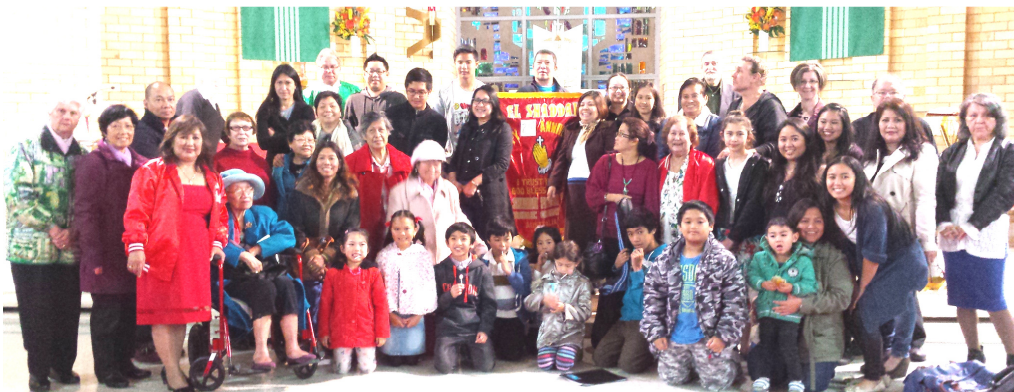
El Shaddai, Bondi-Mascot gathering last Saturday.

The Group expressed their gratitude for the hospitality they enjoyed in our Church.